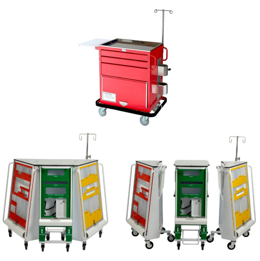
Fig. 3. The standard resuscitation trolley from our hospital, and the newly designed Resus:Station prototype.