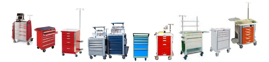
Fig. 1. A selection of resuscitation trolleys commonly found in the UK.

highlighted the fact that ill-stocked resuscitation trolleys had directly led to a number of preventable deaths. Furthermore, of eighty-six incidents involving resuscitation trolleys reported to the National Patient Safety Agency (NPSA) in 2005/6, thirteen were thought to have led to patient harm, and ten to have contributed directly to the deaths of patients. This issue was subsequently referred to in an open access publication from 2007.<sup>4</sup> It is well recognised that the resuscitation process occurs in a high-stress, time pressured environment with a large ad hoc team, thus potentiating the risk of error.<sup>5,6</sup> However, despite this, there are surprisingly few publications describing adverse events and critical incidents during resuscitation. Andersen et al.<sup>7</sup> searched the Danish Patient Safety Database for critical incidents related to cardiac arrest management. Of incidents reviewed, 32% related to equipment issues, in similar areas to those reported by the NPSA. An earlier study by King et al.<sup>8</sup> in 1994 found that 18% of cardiopulmonary resuscitation attempts were delayed by