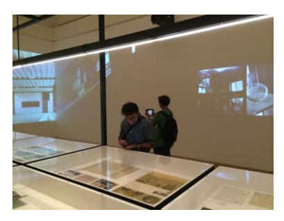
Fig. 5 Installation shot of New Brutalist Image 1949-55, Tate Britain, London, 24 Nov 2014-20 Sep 2015. Curated by Victoria Walsh and Claire Zimmerman.