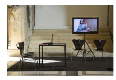
Fig. 2 Kader Attia, installation view of From Material to Abstract, part of Transfigurations, 20-26 June 2014, Museu d'Art Contemporani de Barcelona ©Oriol Molas.

This approach was particularly necessary if the project was to realize a more in-depth discussion of how both the curator and artist experience the process of research and exhibition, and to avoid the professional default into the conventional artist/curator dynamic focused on the curatorial illumination of the artist and work through the exhibition concept and form. While some collaborations were more successful than others, the material that emerged evidenced the increasing precariousness of the status and idea of the art object, as each highlighted the extent to which their work draws on and remediates an ever-expanding repository of digitally generated content, be it playlists of music compiled through iTunes (Attia), museum collection image banks (Henrot), or