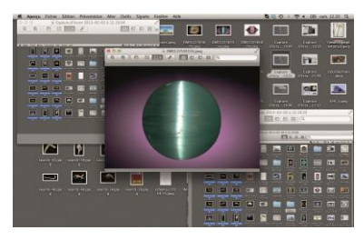
Fig. 3 Screenshot related to Camille Henrot's research index 'Atlas of the Atlas' from the Smithsonian Institution, Washington, 2013 ©Camille Henrot.

The proximity of the research process to the exhibition form, however, is essentially a paradoxical relation fraught with problems and questions around "research as exhibition" and "exhibition as research," and one that, whatever its objectives and disclaimers might be, poses difficult questions for the artist and curator in relation to the expectations of the public display of material, as well as its inherent relation to the market status and value of the artist's work. Intangible heritage and immaterial culture is still difficult for an analog art museum to engage with in terms of giving form through display, even if its museological systems, such as MACBA's, acknowledge its immateriality by conventional museum standards.